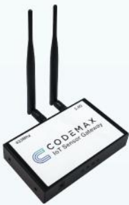
Gateway (WiFi / GSM)