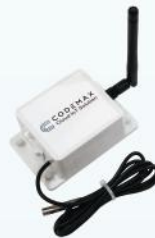
Cold Sensor with Probe