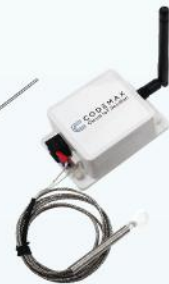
Hot Sensor with Screw Hole Probe

All product ranges are MS ISO / IEC 17025 Certified