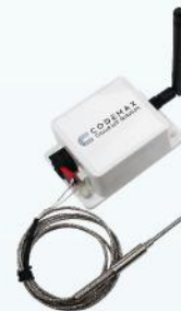
Hot Sensor with Needle Probe